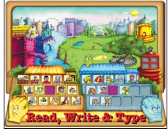
5 - 7 years 40 Online Lessons